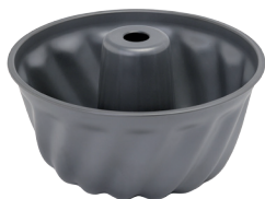
Art. Nr.: BF-0001-B