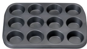
Art. Nr.: BF-0002-B

Complete mould made of plastic Possible up to a mould length of 400 mm